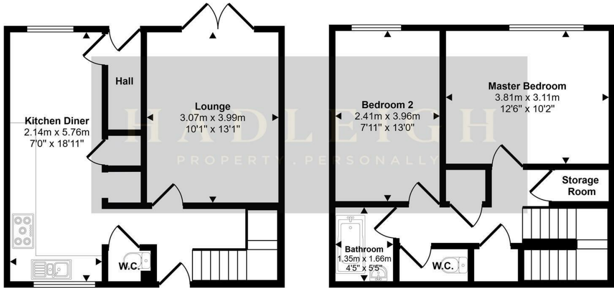
Ground Floor Approx 37 sq m / 397 sq ft

Approx Gross Internal Area 74 sq m / 798 sq ft